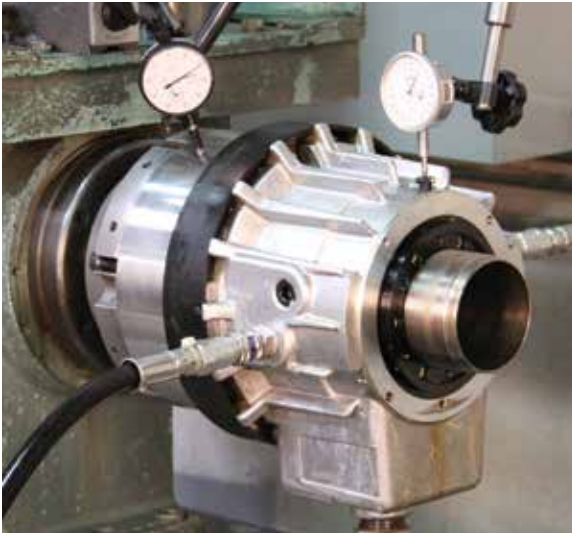
Hydraulic Cylinder Repair

Repairs Using Only Genuine Factory Certified Parts