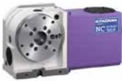
Standard compact unit