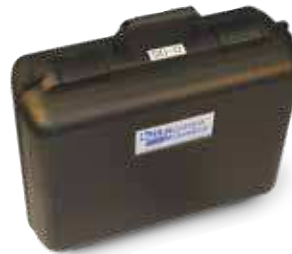
Rugged Carrying Case