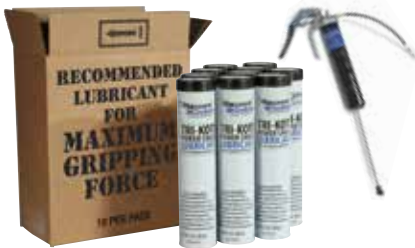
Tri-Kote Lubricant & Optional Grease Gun