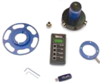
Digital Grip Force Analyzer Kit with Software